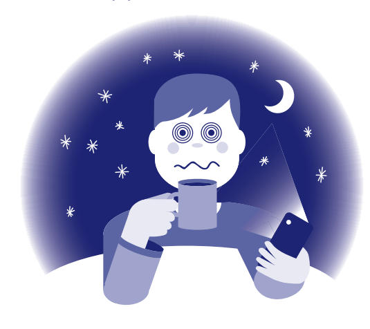
Time for new sleep skills!

Many people with pain find that their sleep is disrupted. New research shows that by adjusting what you do during the day, as well as night, it is possible to achieve a healthier sleep pattern.